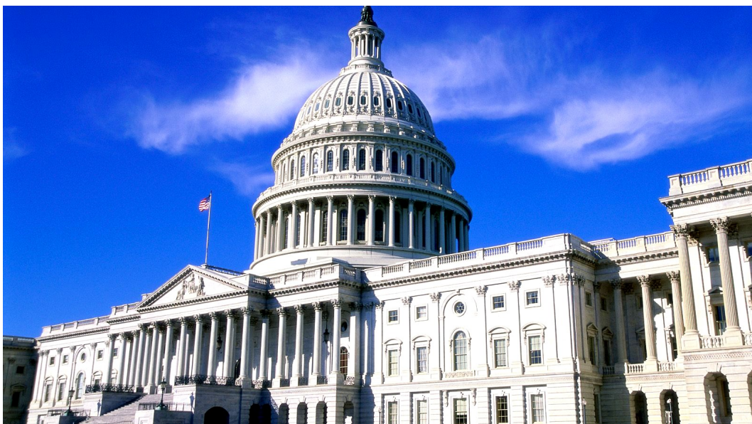
The U.S. Capitol Building