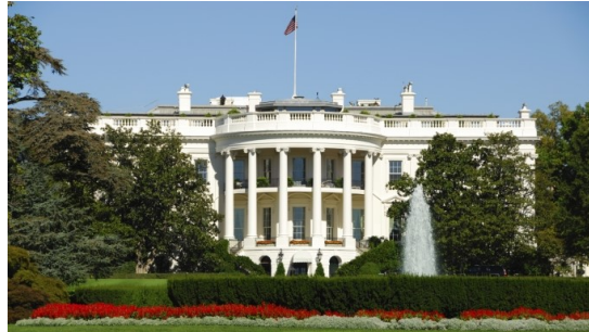
The White House